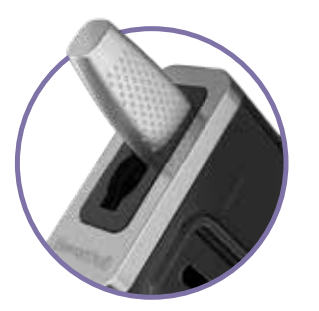
LARGE HANDLE Insert into upper sharpening slot (Chef and Santoku Knives)