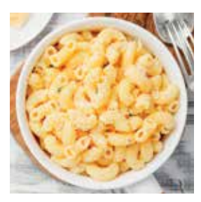
Triple Fusion Heat keeps food at a readyto-eat temperature.