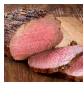
Cook fork-tender meats filled with flavor.