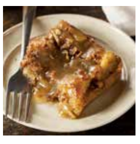
Create warm, decadent deep dish desserts right in the cooking pot.