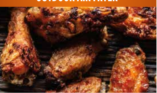
Guilt-free fried favorites, now outdoors Pages 44-55